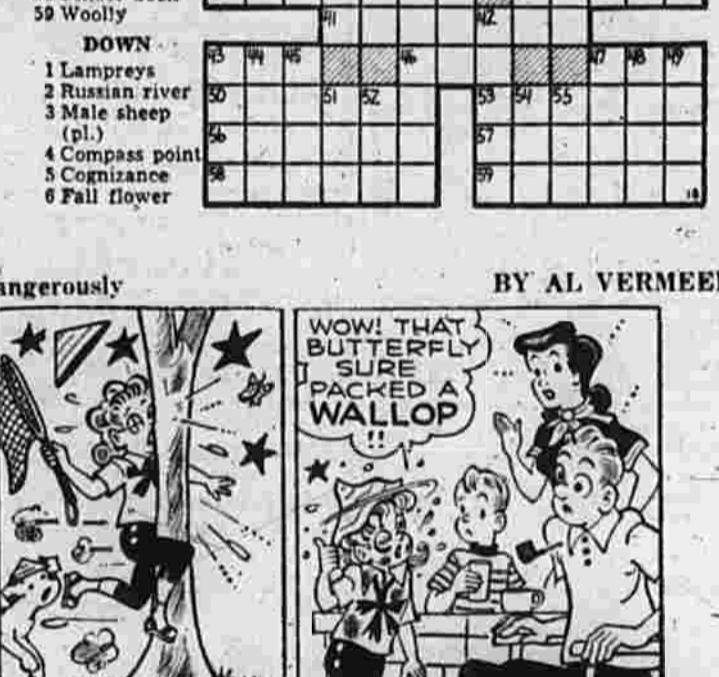
Answer to Previous Puzzle