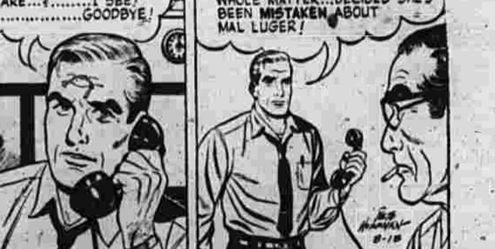
CAPTAIN EASY BY LESLIE TURNER