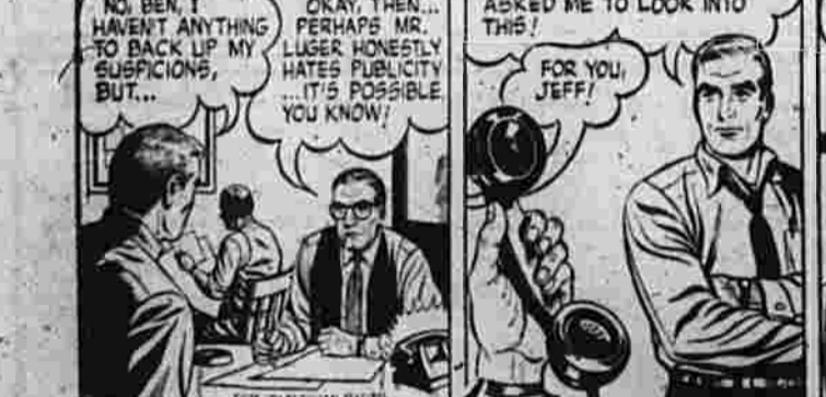
CAPTAIN EASY BY LESLIE TURNER