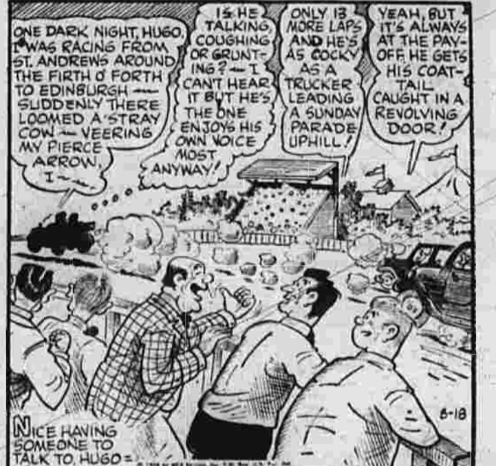
Time To Move BY V. T. HAMLIN