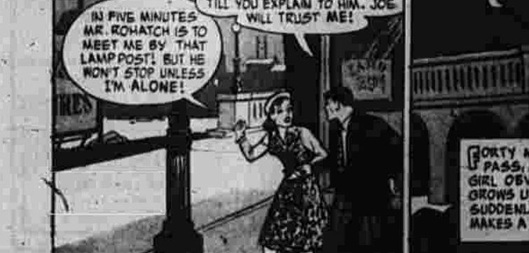
MORTY MEERLE BY DICK CAVALLI